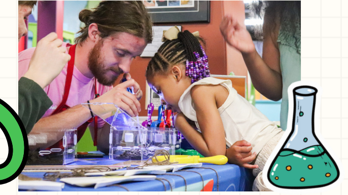
Join us as we continue to host weekly STEAM programming for families, such as Daily Discoveries, Mess Makers, STEAM Sprouts, Read and Play, daily free planetarium shows and more!

Starting in January 2024, we invite children with disabilities and their families to enjoy a welcoming, inclusive space every first Thursday evening of alternate months. These tailored events provide a unique, sensory-friendly environment with hands on exhibits and exploration in our Make Space exhibit area, along with reduced stimuli and lower museum capacity for quality family time. To ensure the best experience, pre-registration is recommended, offering direct communication and updates. Special thanks to the CNS Y-12 Community Investment Fund of the East Tennessee Foundation for their support.