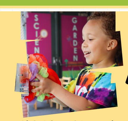
We look forward the next six months of transformative learning experiences!